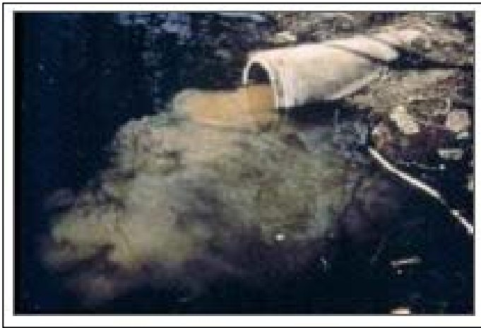
DNR: Storm sewer outfall discharging sediment to a stream.